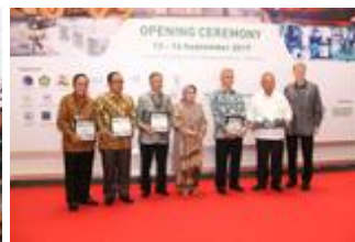
Placard Moments to All Distinguished Guests