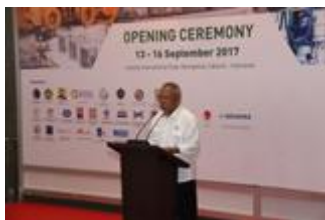
Opening Speech from Minister of Public Work, Republic Indonesia