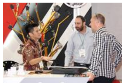
Business Opportunities at Oil & Gas Indonesia 2017